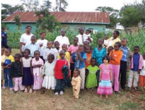
Touching kids' hearts and lives with the love of Jesus.

eternal rock of Christ's finished work, we may hope to have a generation following with us which will maintain the faith and will be better than their fathers."