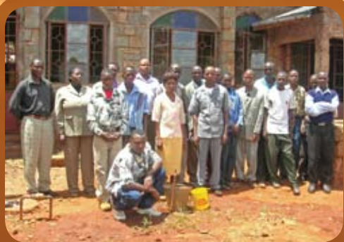
Grace Pastoral Training is a two-year mentoring and seminar program to train pastors and leaders for the Grace Bible Churches of Kenya. Here a new GPT center is opened at Embu Grace Bible Church.