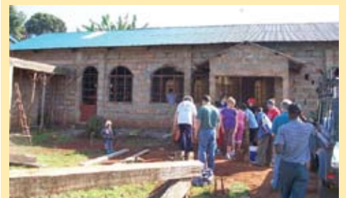
Hard at work painting Embu Town Grace Church in the foothills of Mt. Kenya with Africa Safari 2007.

No matter what God has in store for your future, a short-term mission trip gives any believer a greater appreciation for mission work. Once you go, you will want to support missionaries around the world, both through finances and prayer. Both things you can do individually, but even more you can bring this excitement to your local assembly and encourage them to support those bringing the gospel of the grace of God around the world. ✨