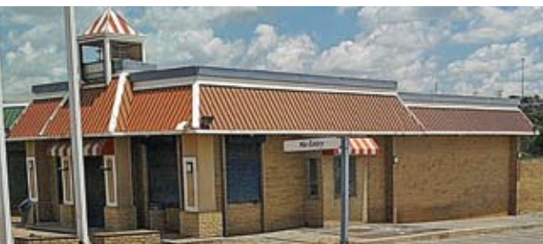
Tembisa meeting place in Johannesburg. $110,000.