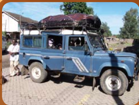
Land Rover, the workhorse of Africa, packed and ready to go on a gospel safari in Kenya, East Africa. There is a saying that the first car seen by most of the people of the world was a Land Rover.