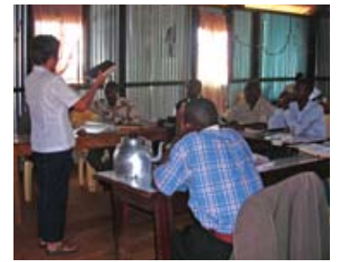
Emphasizing the Christian education curriculum to teachers in Thika.

Will you join hands with me in prayer to Bridge the Gap in training Africans to reach and teach children? ✨