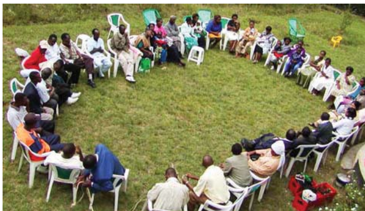
The love of Christ breaks down walls and binds us together.

You are all sons of God through faith in Me, for all of you who were baptized into Me have clothed yourselves with Me. There is neither Jew nor Greek, slave nor free, male nor female, for you are all one in Me. (Gal.3:26-28)