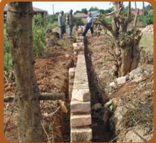
A straight foundation is necessary for a long-lasting church building. Here Carlo Paña inspects a building project in Kampala, the capital of Uganda.