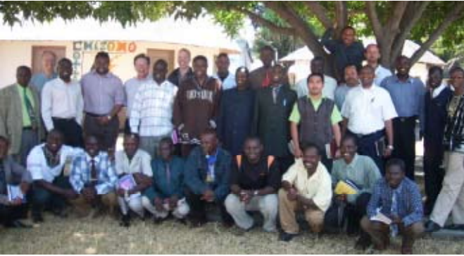
Delegates from nine African nations and the United States met in Malawi on 12-15 August 2008 to launch the AAGF.

We are thankful to our Almighty God when our minds flash back to the unity of Grace believers who gathered together at Ibis Gardens in Lusaka, Zambia, 12-19 January 2004, for the first African Leadership Conference where