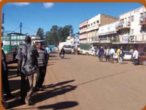
People doing business in a small town in Kenya. Although most of the population makes their living from farming, towns and cities are growing rapidly. Kenya population is now 30 million.