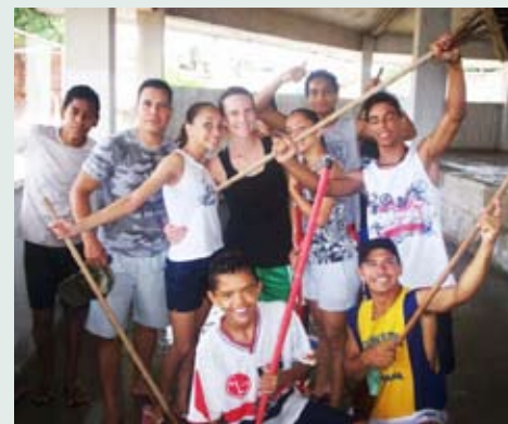
Cleaning the Church of Ibura

Last summer God opened doors for me to complete my Missions practicum in Recife, Brazil. I was scared. As an MK with 3 years in the Missions degree at Grace Bible College, I still didn't feel 100% ready. But I traveled alone for 21 hours to a country and culture never experienced before. I worked with new people in a new language. It was one of my most challenging steps of faith in life, and also turned out to be one of the best. Through my fear God showed me his strength, love and faithfulness countless times. I worked alongside missionaries and leaders, new friends, learning a new language, gave my testimony, discipling, teach-